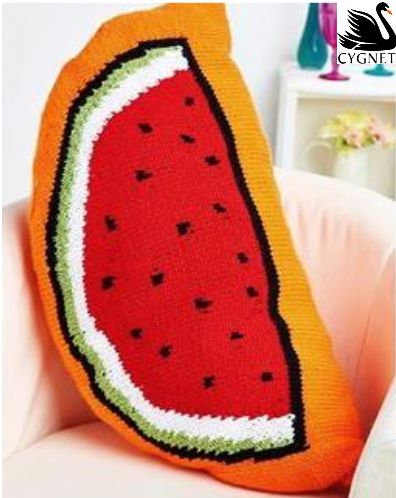
CY1052 Cygnet Chunky Watermelon Cushion